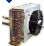
Available in remote condenser version (R.C. sold separately)