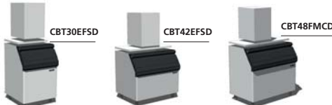
MF 56+SB530+Top (sold separately)