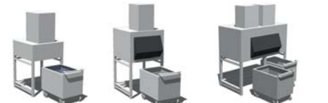
MF 56+SIS300 (sold separately)