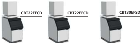
MF 56+SB193+Top (sold separately)